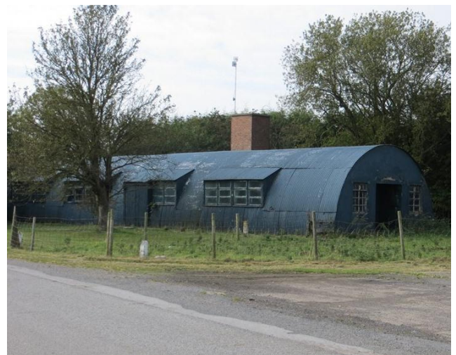
RAF Strubby Guard Room