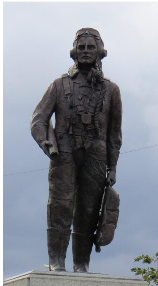
RAF Navigator statue at Cleethorpes, Lincs