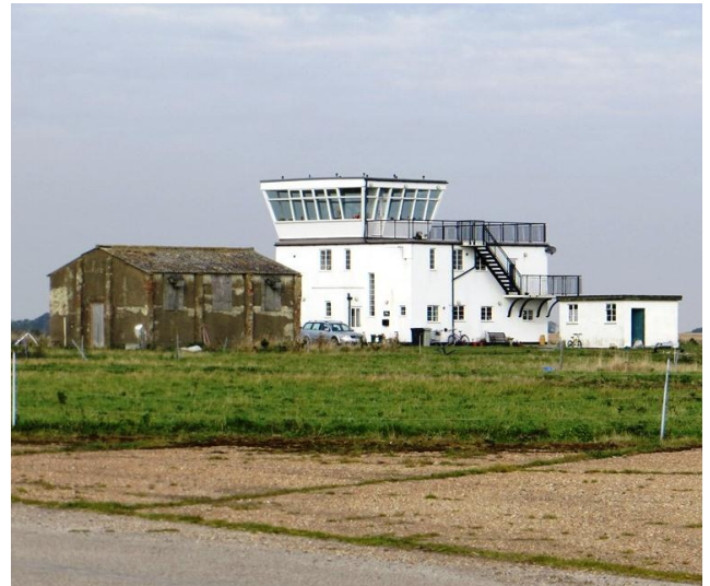
RAF Strubby Watch Room

A lot of the original wartime buildings still survive and a few are pictured below, including the former Watch Room, which is now someone's house.