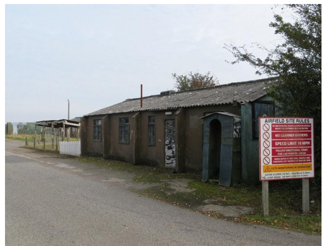
RAF Strubby Fire Station